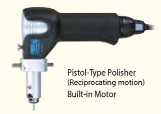
LUSTER 1483 NLS-110 (P20) Exclusive use for Emax EVOLUTION

• Wide selection of attachments available depending on the application.