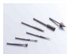
Electroplated Diamond Burs

Please see the NAKANISHI "POLISHING TOOLS" Catalog